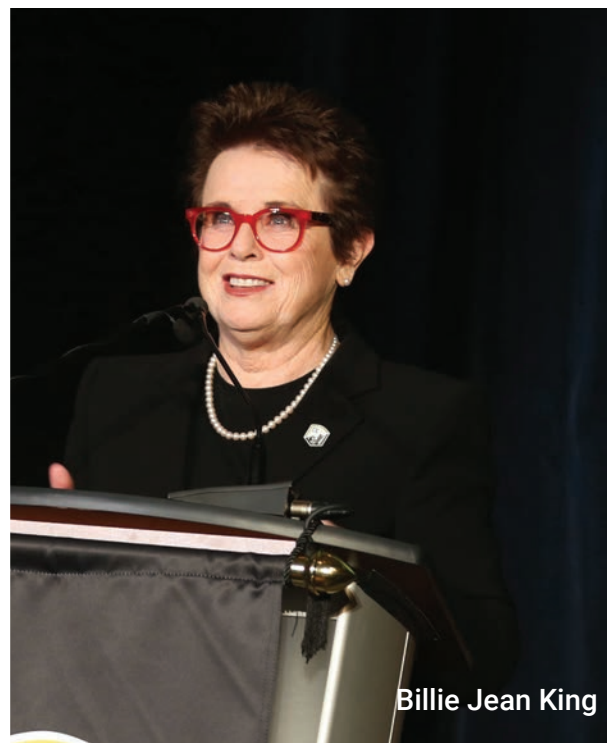
Billie Jean King

MORE THAN 250,000 distinguished alumni call Cal State LA their alma mater. Our alumni include leaders from across industries, including government, public health, the sciences, the sports world, and more.