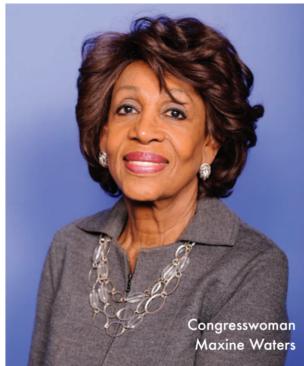
Congresswoman Maxine Waters